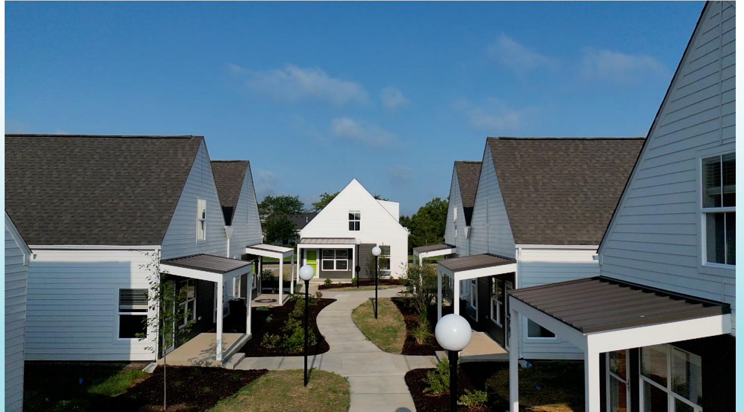
Cumberland Cottages, Fishers