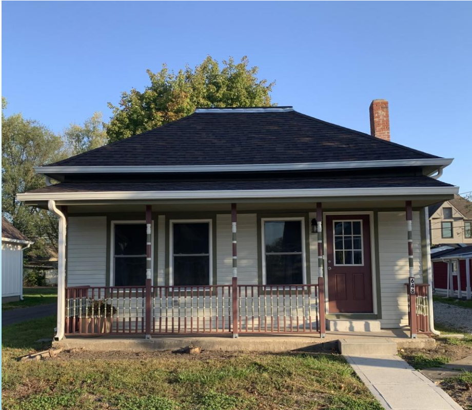
Plum Prairie, Noblesville

HAND builds, preserves, and advocates for affordable housing in the suburbs.