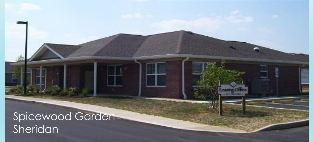
Spicewood Garden Sheridan