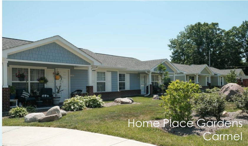
Home Place Gardens Carmel