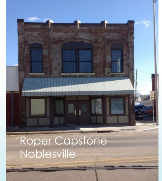
Roper Capstone Noblesville