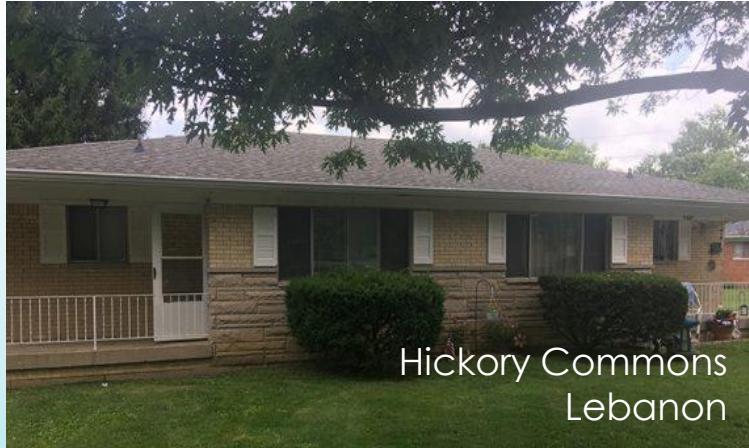
Hickory Commons Lebanon