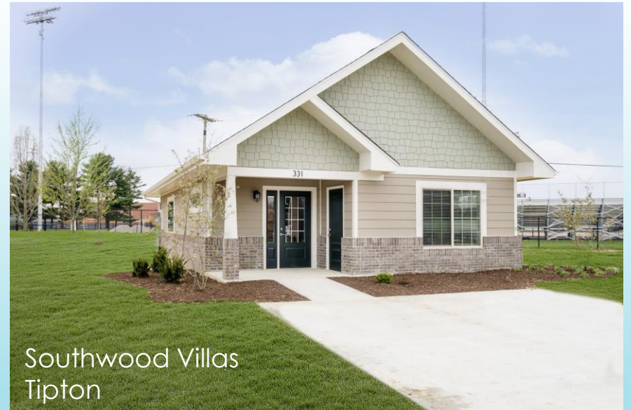
Southwood Villas Tipton

Home Place Gardens was the 2019 LISC "Love thy Neighborhood" Vitality Award Winner for Central Indiana