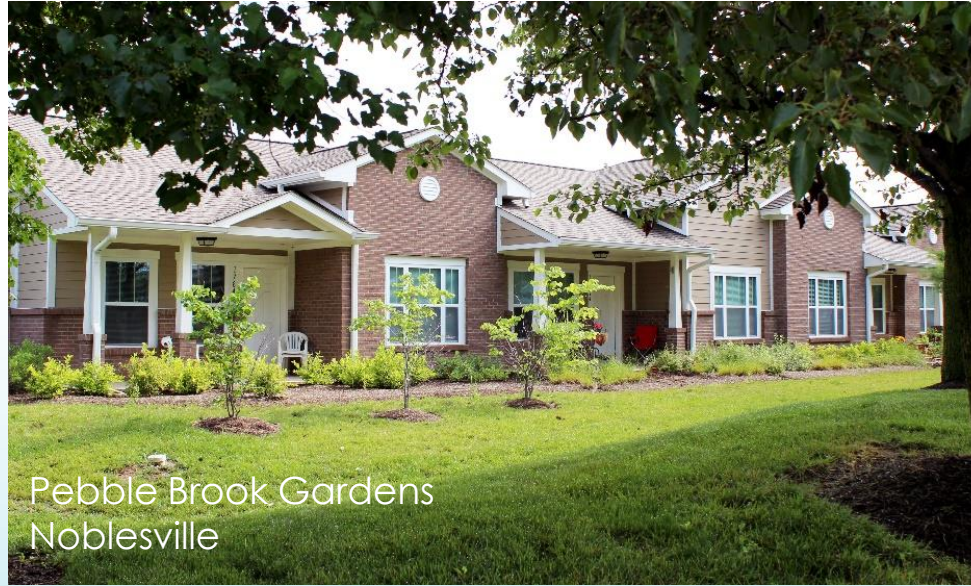
Pebble Brook Gardens Noblesville