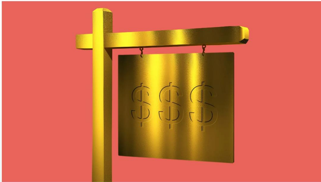
Illustration: Brendan Lynch/Axios