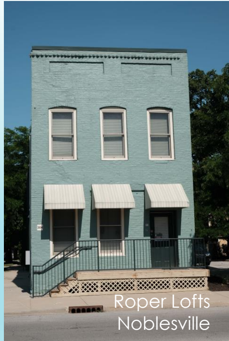
Roper Lofts Noblesville