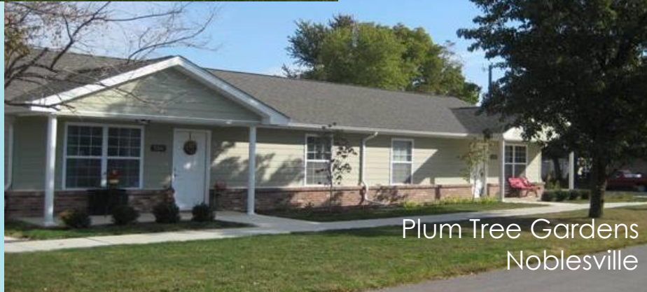
Plum Tree Gardens Noblesville